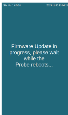
Figure 4. Firmware Updating Screen