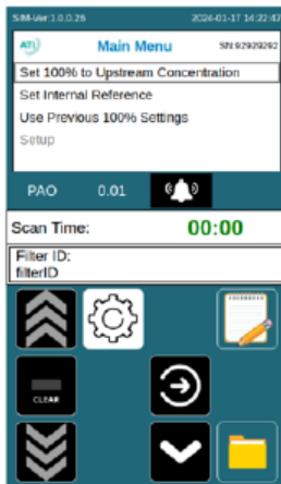
Figure 3. iProbe Plus in Main Menu Screen